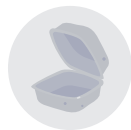
Clean plastic containers