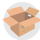
Paper & cardboard