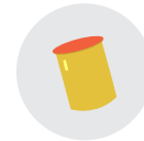
Plastic bottles & aluminium cans Remember to check if it has the 10c label.