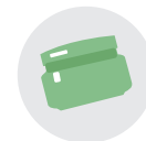
Glass jar Brown, clear and green only